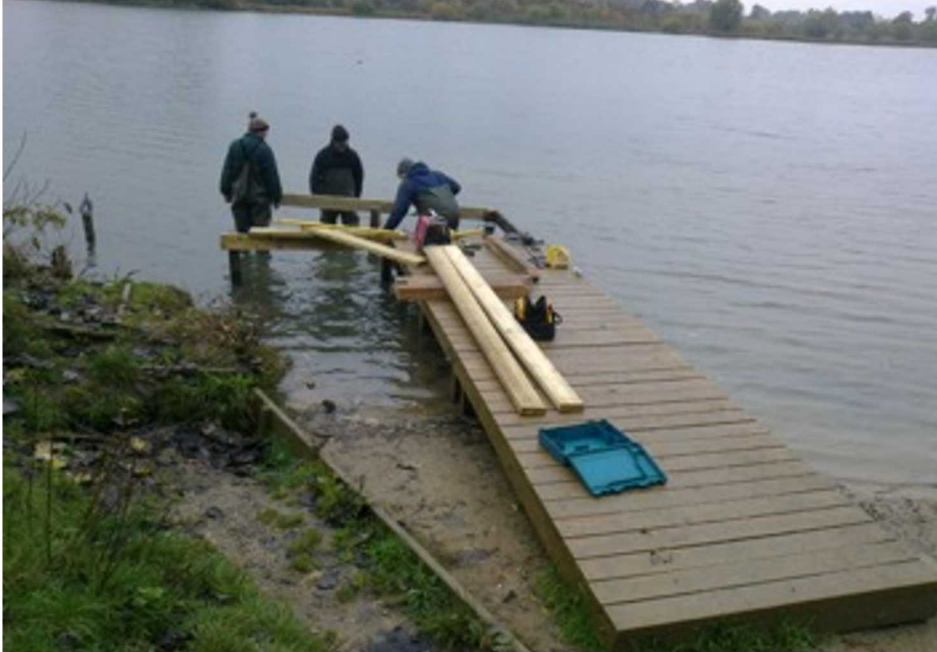
Sam, Peter and Ross working on the jetty

Peter writes 'The volunteers have continued to be very busy working up to the Christmas break. Tasks have included clearing and burning overgrowth in the area of the Spit, cutting willow on the bund, rebuilding the jetty on the main lake, refitting refurbished bench tops, cutting back vegetation and creating hibernation areas in the Snake Pit to name but several. A number of us even completed a brush-cutter course which is like strimming, only with attitude!